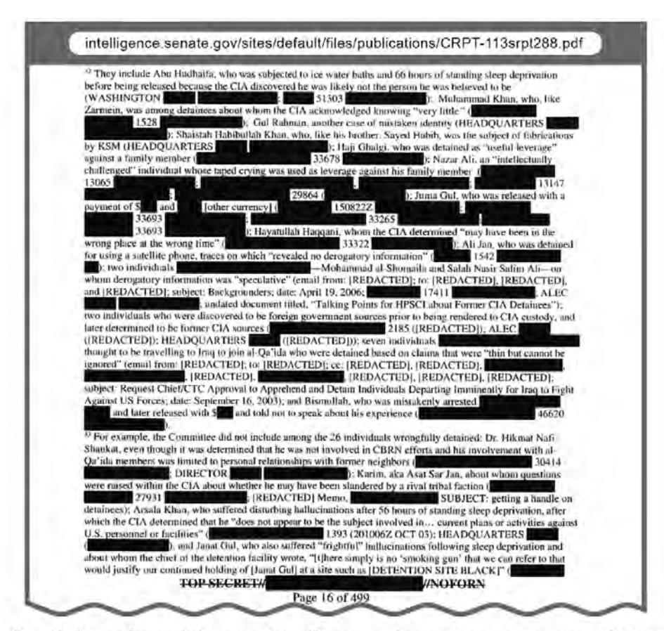
Page 45 of the redacted Senate Intelligence Committee report on CIA torture.

The following year, 2015, CIA agents illegally hacked the Senate Intelligence Committee computers to thwart its investigation into the spy agency's detention and torture program. Haines, who was then the agency's deputy director, overruled the CIA's own inspector general, refusing to discipline the CIA agents, thereby violating the US Constitution's separation of powers provisions. According to Kiriakou, Haines not only shielded the CIA's rogue black bag team that criminally hacked the Senate Intelligence offices, but then awarded its agents the "Career Intelligence Medal." <sup>156</sup> By taking the side of outlaws and defending and rewarding their lawbreaking, Haines won the loyalty of the worst elements within the CIA and demonstrated her contempt for the thousands of honest, lawabiding CIA employees appalled by that abuse of power. <sup>157</sup>