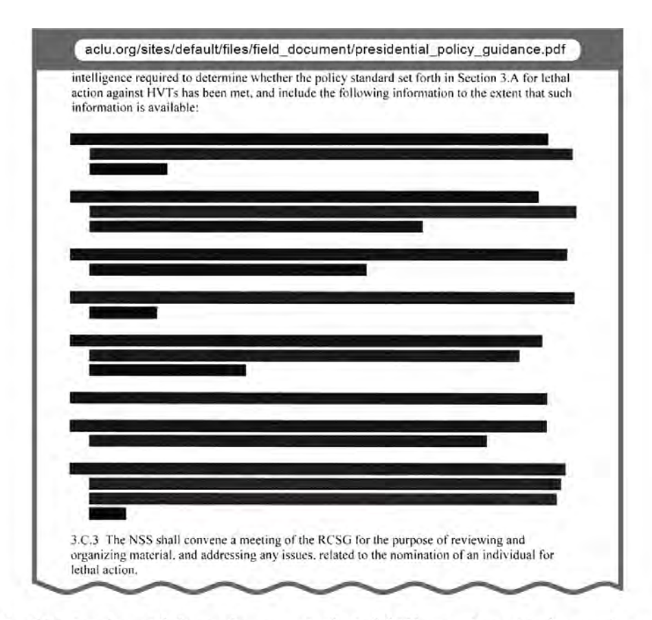
Page 12 of Haines's guidelines for extrajudicial killings. Required generic profile entries for individuals "nominated" for lethal action are redacted.