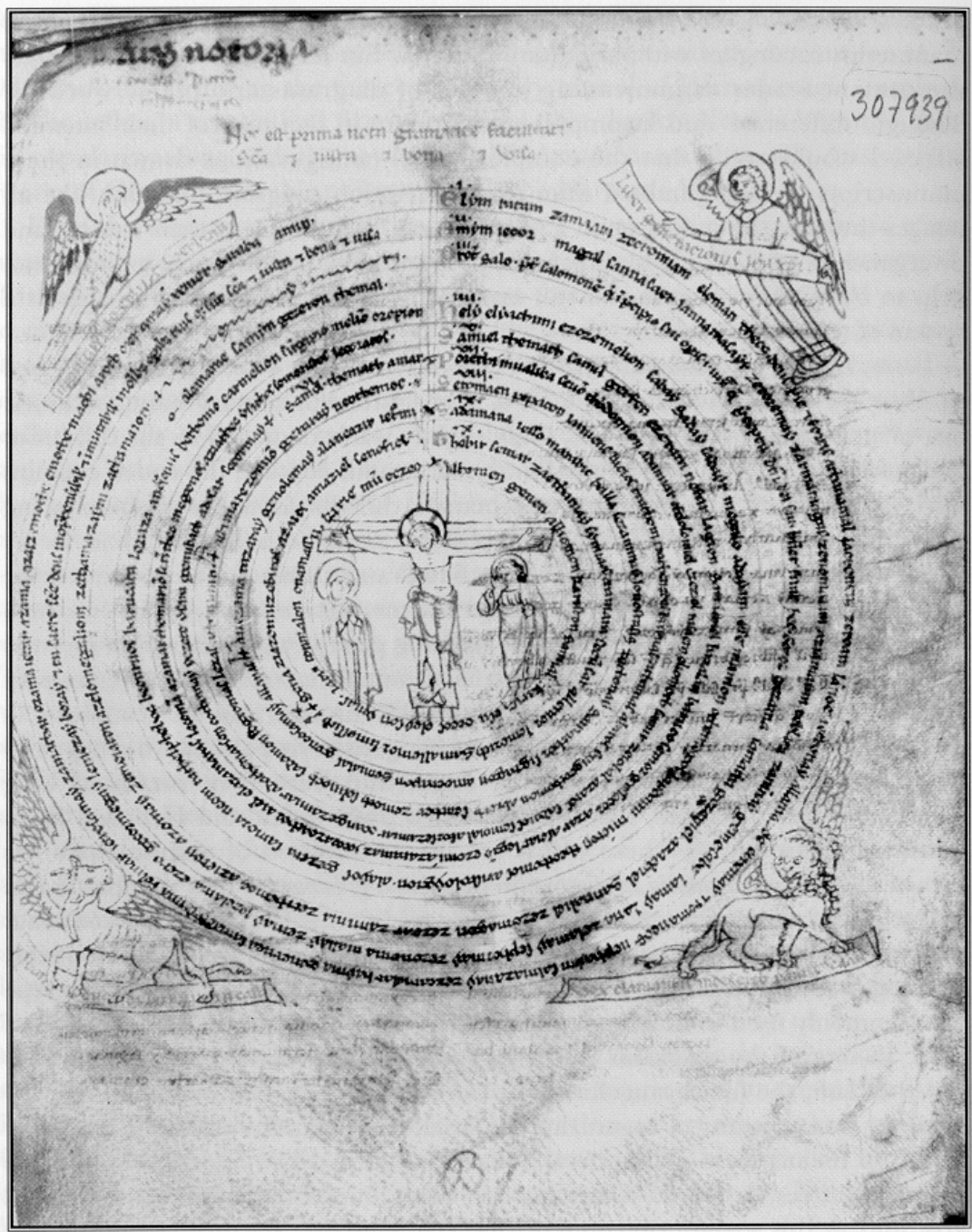
The First Note of Grammar