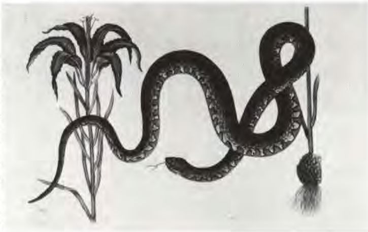
© Drawing by Catesby, ca. 1731

The patronage for wildlife books—even spectacular folios with hand-colored lithographed plates—was relatively widespread compared to the support given to wildlife paintings. It was only in 1874, after all, that the U.S. Congress finally authorized the unheard-of expenditure of $10,000 for a large painting of the Grand Canyon, by Thomas Moran, to hang in the Senate lobby. Even though it is dangerous to ascribe precise motives to the actions of others taken in other times, perhaps we can state that the Grand Canyon painting does mark a turning point in the official view of the importance of wilderness, and by extension, of wildlife. Since then the interest in and appreciation of wildlife and wilderness art has grown to the extraordinary levels they enjoy today.