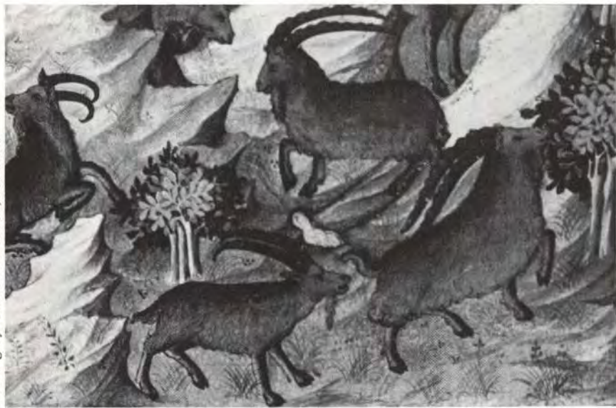
Drawing by Gaston Phoebus, ca. 1390