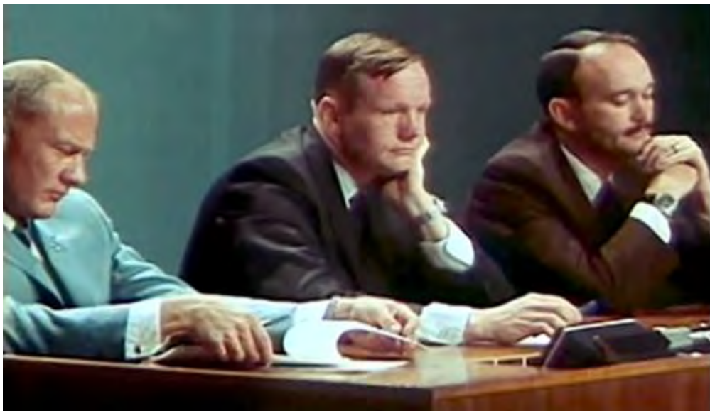
Victory or Defeat? Apollo 11 Post Flight Press Conference (July 1969).

At the executive producer's request, at this point in Astronauts Gone Wild I first edited in a brief clip from A Funny Thing Happened... that of the Apollo 11 crew's only formal and complete press conference of their alleged historical mission. You can see from the press conference picture below ( left to right ) that Buzz Aldrin, Neil Armstrong, and Michael Collins look as though they are obliged to do something that they find morally reprehensible, which was precisely the case. As this incredible fraud was indeed taking place, it was a soul-souring experience that could not be wiped away from their faces. This is exactly why their expressions for nearly the entire press conference looked like they were attending their mother's funeral, rather than being the winners of a great victory. The same was true the day of their launch. Instead of joking as they were about to risk life and limb in an untried mission, as was always done before genuine space missions to ease the tension, they were all uncharacteristically solemn and melancholy, to the astonishment of the uninformed assistants around them.