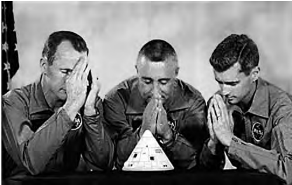
The Apollo One crew (left to right, Ed White, Virgil "Gus" Grissom, and Roger Chaffee) expressing their concerns about their spacecraft's endless problems, who then presented

Apollo astronaut Virgil Grissom was so frustrated with the incompetence and lack of progress in the Moon landing program that he famously hung a large lemon on the spacecraft's entrance door just days before his death, indicating the vehicle's complete inadequacy to perform as required to reach the Moon.