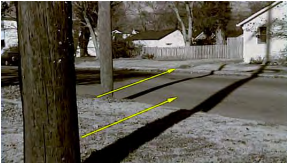
Real Sunlight – Note the parallel shadows – Author's photo.

It has been prophetically proclaimed in the scriptures that, “Most people have eyes that do not see, and ears that do not hear. ” This is likened to a household saltshaker always being placed in the same spot for fifty years; left kitchen cabinet, on the left side of the third shelf. If a family member inadvertently moves the salt shaker to the same left kitchen cabinet, likewise on the third shelf, yet on the right side instead of on the left side, other family members do not see it, even though it is right there in front of their eyes. It is hidden in plain sight , yet not seen due to years of programming. Likewise, I was looking at the same pictures of the alleged Moon landings over and over again for a full decade as an ardent supporter of the missions, every single day on my bedroom wall, yet still not noticing the obvious inconsistencies and abnormalities that would quickly give away the deception, if only I would look beyond my many years of repeated conditioning.