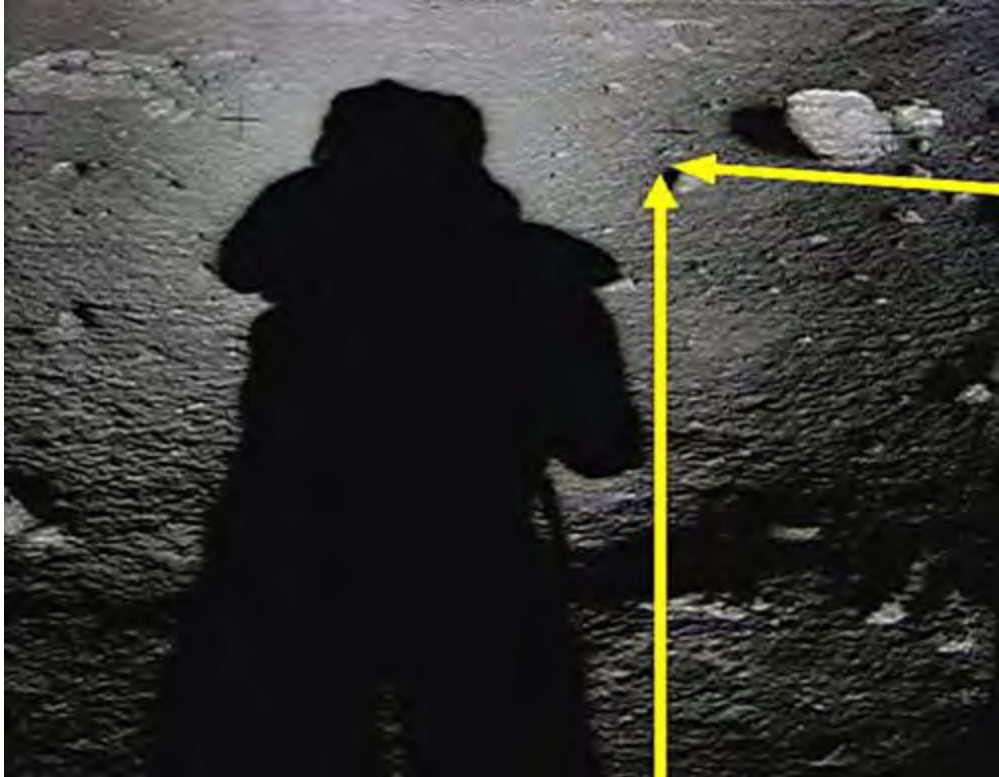
Artificial, electric lighting in a NASA Apollo photograph Note the intersecting shadows.

The above picture, allegedly taken on the Moon in sunlight , was obviously not taken on the Moon at all , rather in a photographic film studio illuminated with electrical light. In fact, all that you need to prove the entire Moon landing fraud is this one photograph, with its ninety-degree diverging shadows, which simply cannot be duplicated in sunlight, which always casts parallel shadows. All that you have to do is go outside at high noon on a cloudless day, have yourself and a friend stand about five feet apart from one another, in the same positions as the above rock and “astronaut” are, and you will see quite plainly that the two sunlit shadows will never, ever intersect, and certainly not at ninety degrees when they are only five feet apart from one another.