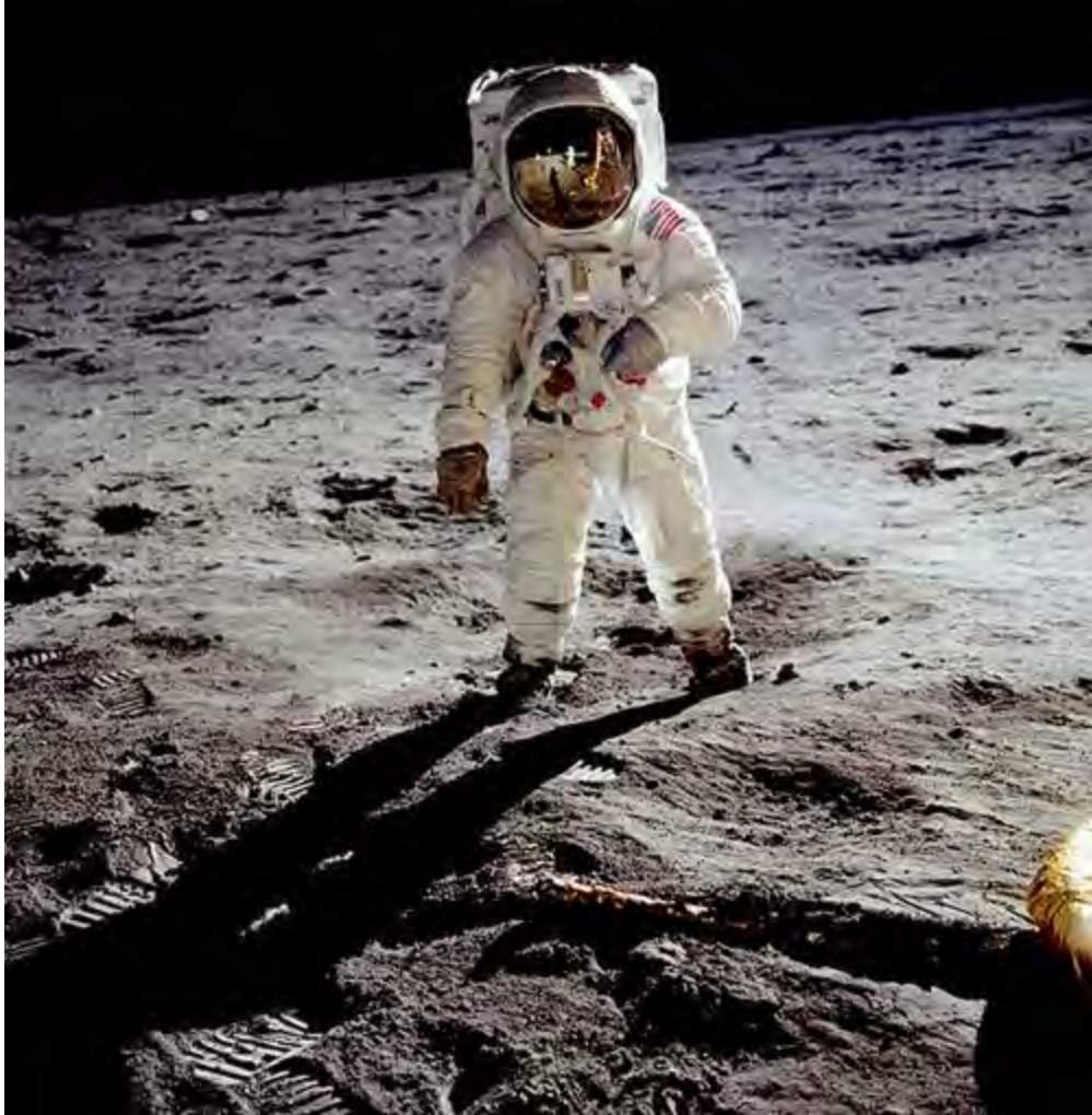
Aldrin Standing on a studio lunar landscape (AS11-40-5903)

The most significant whistle-blow within this image is the fact that (as has been demonstrated conclusively in previous research by others) the position of the camera above the surface of the Moon was at the same level as the alignment of the horizon line extrapolated across the visor of the astronaut . The photograph was taken from a position higher than it should be in this situation. It was taken from eye level, and not by the astronaut, as has also been demonstrated in previous research.