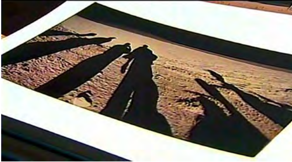
Artificial electric lighting from a National Geographic show unintentionally demonstrating intersecting shadows.

By the way, and not so coincidentally, the corrupt United States government openly acknowledges giving continual financial support to National Geographic , and I believe secretly directs or owns it for propaganda purposes, purchased with their admitted “missing” two thousand three hundred billion dollars, after all, he who pays the piper calls the tune. This Moon landing hoax is far from the first time, or the last time, that the CIA’s “bought and paid for media” was grossly complicit in horrendous crimes against their own people. In fact, CBS’s main national spokesperson for the Moon landing fraud, Walter Cronkite, speaking of the real role of the media, is on the record for privately saying to his fellow Masonic lodge members (of which many United States presidents, CIA directors, and Apollo astronauts belong), that “ Our task is not to tell the truth; we are opinion molders. ” [emphasis added]