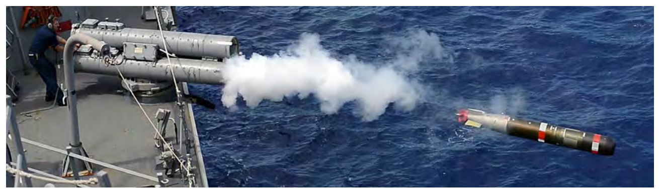
A U.S. sailor aboard the guided missile destroyer USS Mustin (DDG 89) fires a torpedo at a simulated target during Valiant Shield 2014 in the Pacific Ocean September 18, 2014.

Increasing U.S. and allied naval force posture and presence in Russia's operating areas could force Russia to increase its naval investments, diverting investments from potentially more dangerous areas. But the size of investment required to reconstitute a true blue-water naval capability makes it unlikely that Russia could be compelled or enticed to do so.