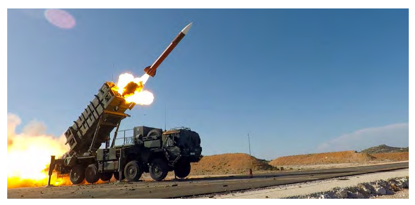
Exercise Artemis Strike was a German-led tactical live-fire exercise with live Patriot and Stinger missiles at the NATO Missile Firing Installation in Chania, Greece, from October 31 to November 9, 2017. More than 200 U.S. soldiers and approximately 650 German airmen participated in the realistic training within a combined construct, exercising the rigors associated with force projection and educating operators on their air missile defense systems.

The task of "extending Russia" need not fall primarily on the Army or even the U.S. armed forces as a whole. Indeed, the most promising ways to extend Russia—those with the highest benefit, the lowest risk, and greatest likelihood of success—likely fall outside the military domain. Russia is not seeking military parity with the United States and, thus, might simply choose not to respond to some U.S. military actions (e.g., shifts in naval presence); other U.S. military actions (e.g., posturing forces closer to Russia) could ultimately prove more costly to the United States than to Russia. Still, our findings have at least three major implications for the Army.