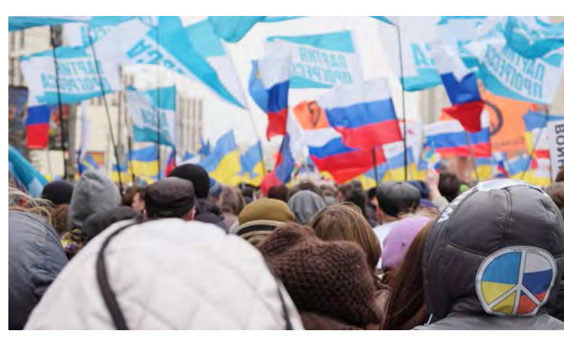
Muscovites protesting the war in Ukraine and Russia's support of separatism in the Crimea on the Circular Boulevards in Moscow on March 15, 2014.

While none of these measures has a high probability of success, any or all of them would prey on the Russian regime's deepest anxieties and might be employed as a deterrent threat to diminish Russia's active disinformation and subversion campaigns abroad.