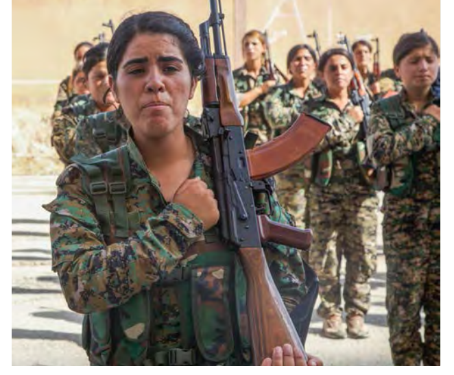
Syrian Democratic Forces trainees, representing an equal number of Arab and Kurdish volunteers, stand in formation at their graduation ceremony in northern Syria, August 9, 2017.

Promoting liberalization in Belarus likely would not succeed and could provoke a strong Russian response, one that would result in a general deterioration of the security environment in Europe and a setback for U.S. policy.