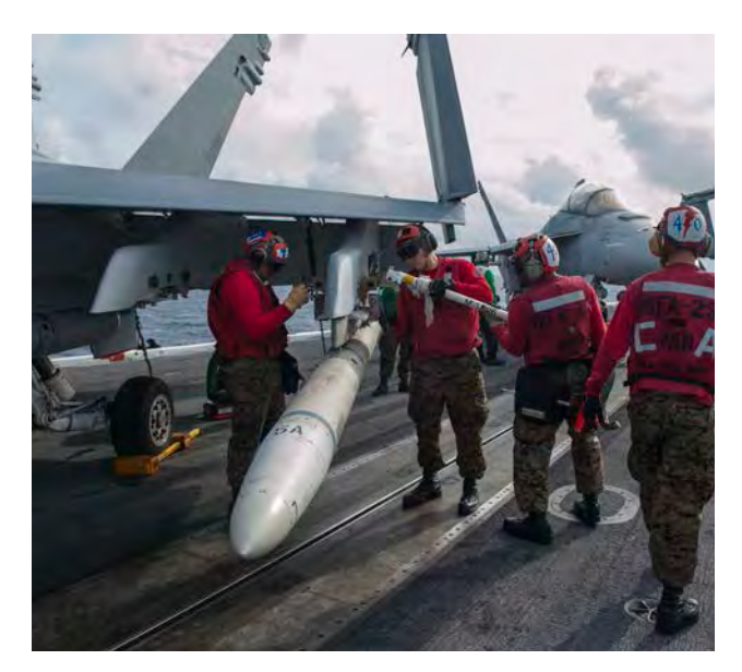
Marines assigned to the Thunderbolts of Marine Fighter Attack Squadron (VMFA) 251 remove a training AGM-88 HARM from an F/A-18C Hornet on the flight deck of the Nimitz -class aircraft carrier USS Theodore Roosevelt (CVN 71).

For example, investing in ballistic missile defense