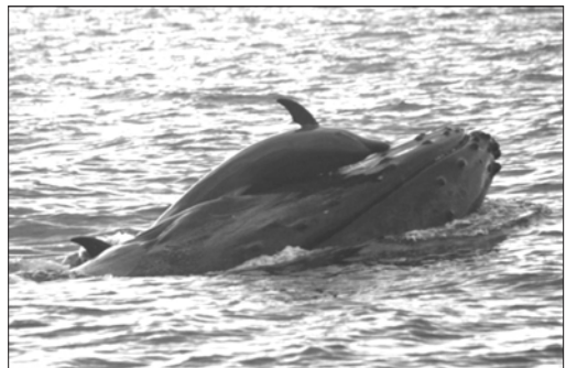
Figure 2. A bottlenose dolphin lifted repeatedly out of the water by a humpback whale about 800 m off the northwest coast of Maui, Hawaii, on 25 January 2006